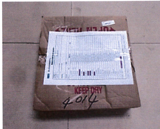
Photo of Samples